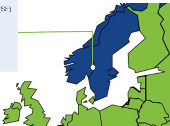
Illustration by Analysys Mason

Värmland County Administrative Board (SE) Torsby municipality (SE) Innlandet County Council (NO) Grue municipality (NO) Eidskog municipality (NO) Kongsvinger municipality (NO)