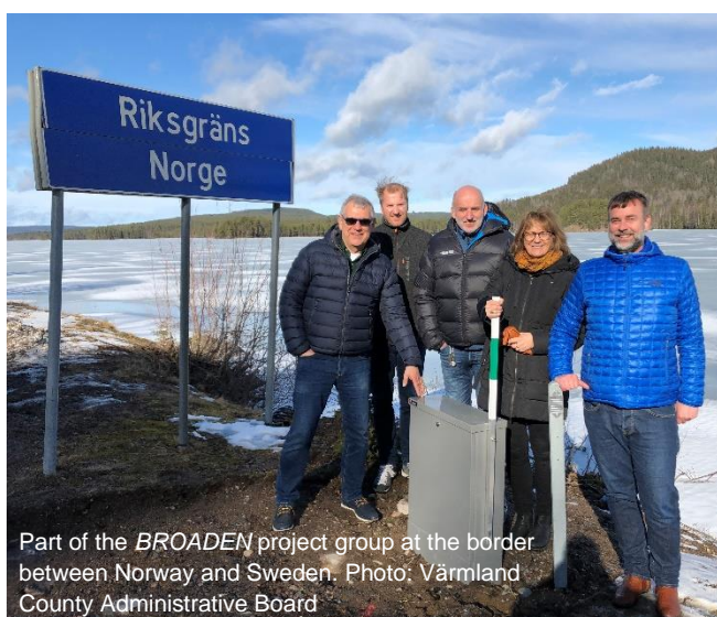
Part of the BROADEN project group at the border between Norway and Sweden.

Turning to the pilot FOR YOU , Region Värmland and Värmland County Administrative Board coordinated the initiative on an overall level in Sweden, in close collaboration with the municipalities. The concept could then be transferred also to the Norwegian municipalities Eidskog, Grue and Kongsvinger, and picked up by Telia Company (Norway).