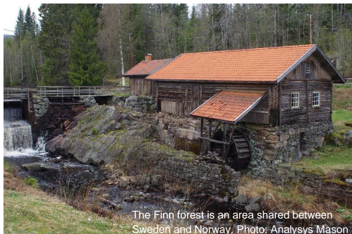
The Finn forest is an area shared between Sweden and Norway.

For centuries, there has been an ongoing cooperation between Sweden and Norway in our region. The Finn forest is located across the border. It is natural that we cooperate with our Norwegian neighbours in different areas. (politician Torsby municipality)